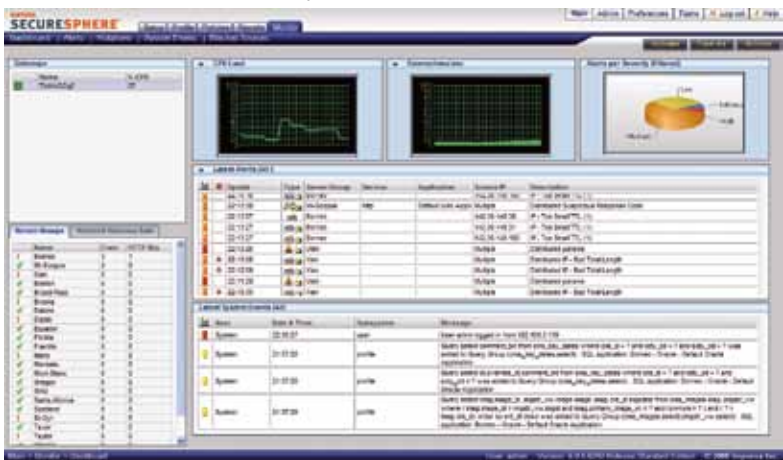
SecureSphere's real time dashboard

SecureSphere can be deployed as a standalone appliance and can also scale to protect a cluster of Web servers. The SecureSphere SE Management Server offers a centralized configuration, monitoring, and reporting infrastructure to manage multiple SecureSphere WAF appliances and many applications from a single console.